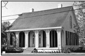
The Mercer-Wooten House

The bottom line is that the house will be saved when, just a few months ago, preservationists thought it would be razed.