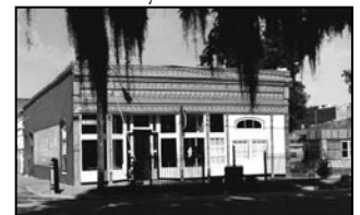
Sutton's Corner Frontier Country Store Museum