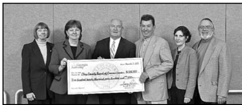
Clay County received a grant for $320,700 to purchase Sutton's Corner Frontier Country Store Museum